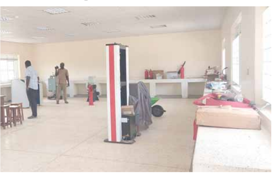
Kitgum Technical Institute soil testing laboratory.

It was transformed into a modern institute to train in sufficient numbers the manpower required for road construc-