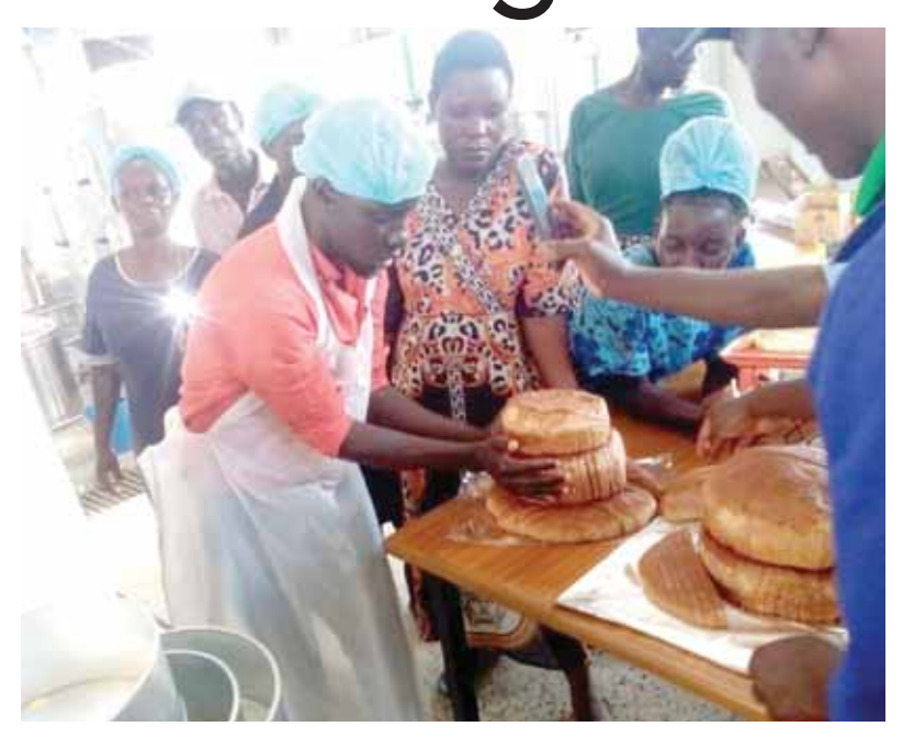
Kaberamaido Technical Institute students acquire baking skills.

Kaberamaido Technical Institute delivering demand-driven skills