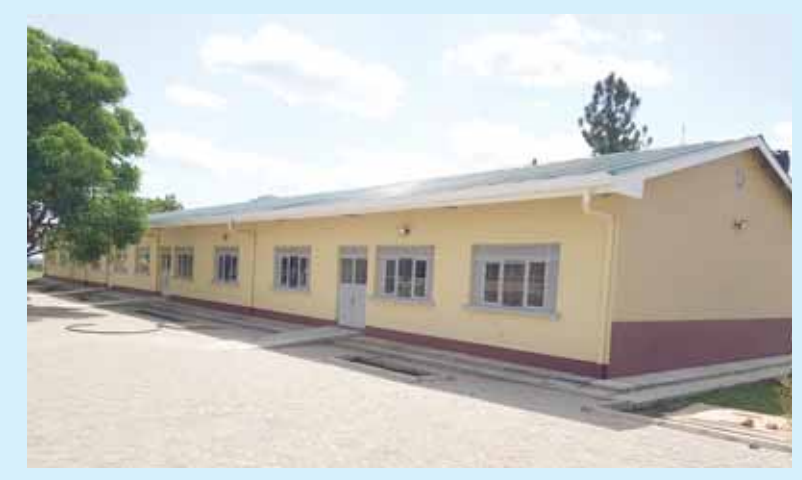
NAIT training laboratory and classroom.