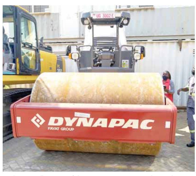
A vibrating roller is one of the equipment at UTC Lira that students use for training to acquire skills.

While UTC Lira trained human resources at higher levels programmes, the networking vocational training institutes trained