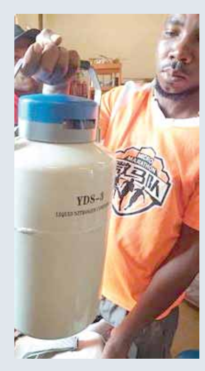
A trainee with an artificial insemination container.

"After the course, I set up a poultry farm and currently, I have