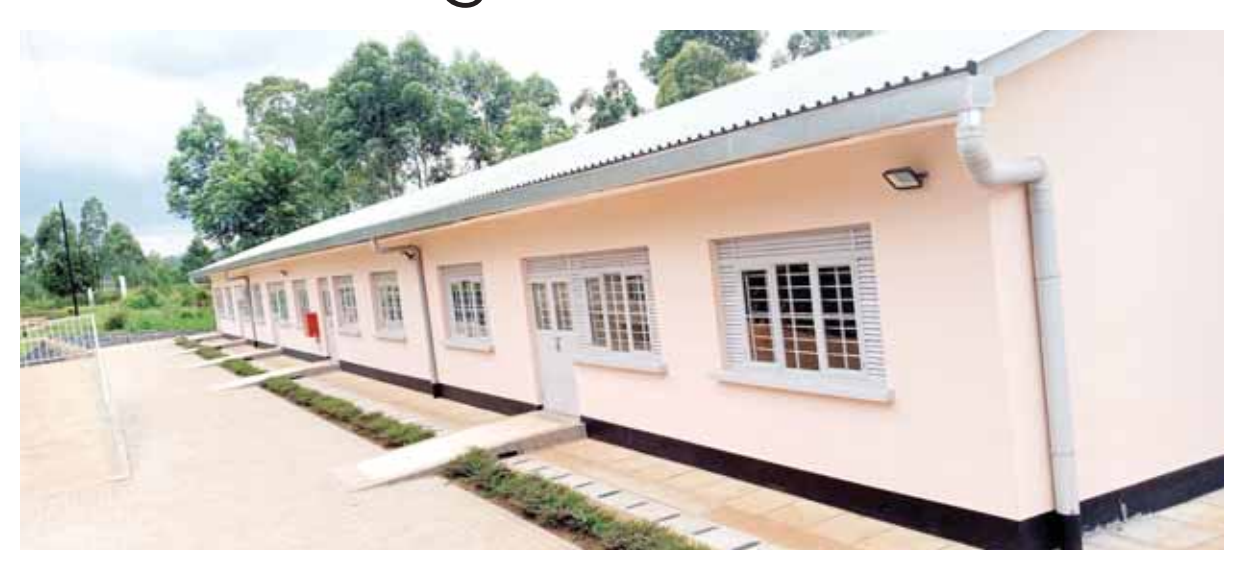
NAIT training laboratory and classroom at Ora Technical Institute.

Assessment manual were developed for the road construction curricula. Each manual was inline with the occupational standards and the block of competences.