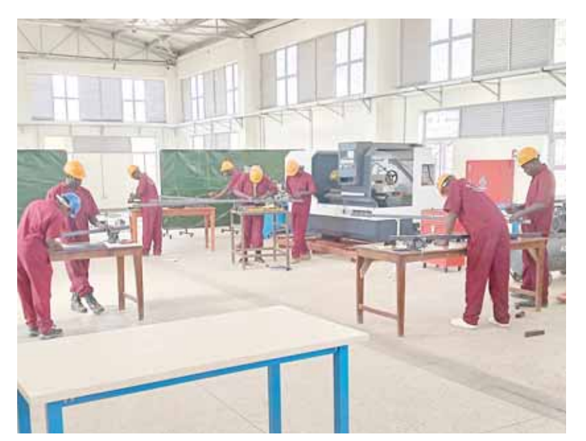
Students in Karera Technical Institue, under the USDP programme, study in the welding workshop.

After the training, the students undergo a one-month industrial training with supervision by their