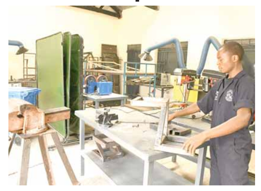
A student in the workshop at Lake Katwe Technical Institute.

students (25 boys, 15 girls) and they completed their training in December 2022. The second cohort of students is ongoing with 15 students; 10 boys and five girls.