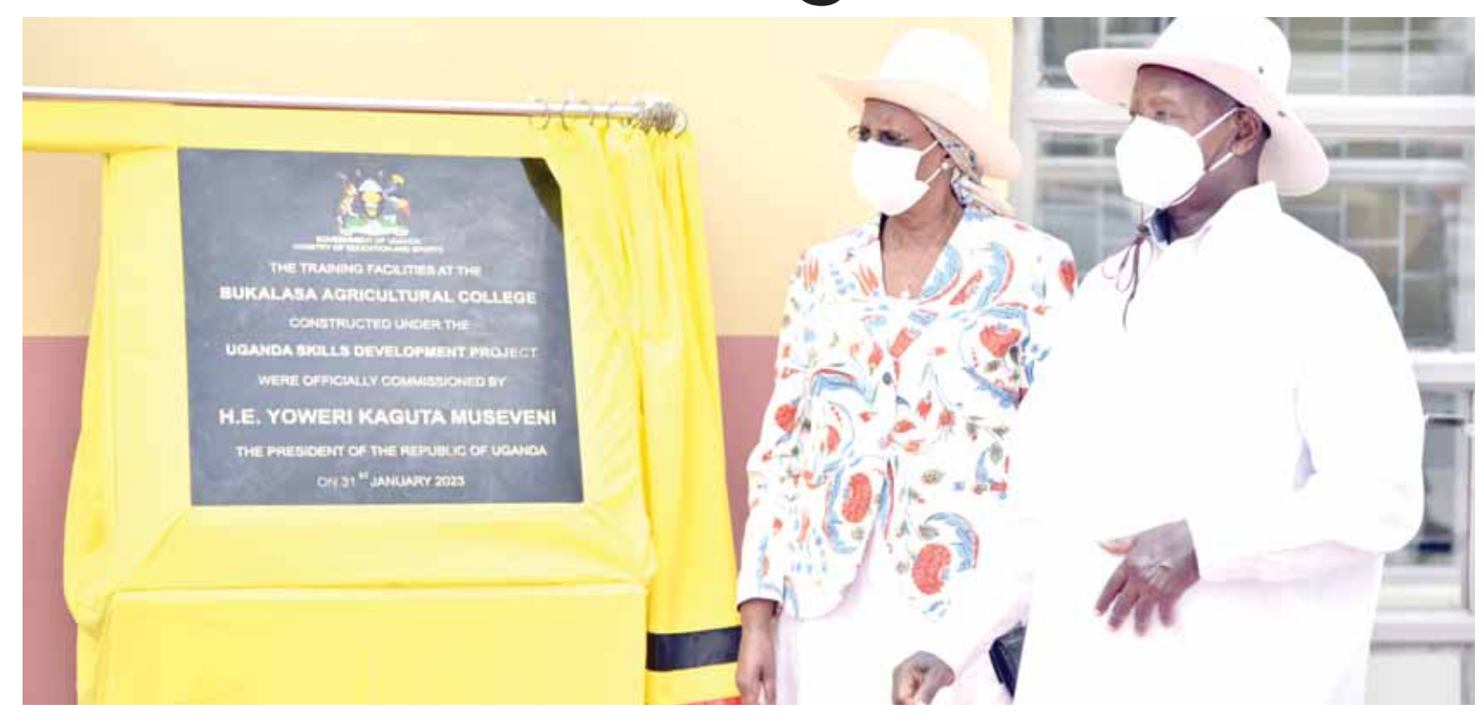
Museveni (right), and First Lady, also Education Minister Janet Museveni at the commissioning of a training facility at Bukalasa Agricultural College in Luweero District on January 31, 2023, built under USDP, Ministry of Education and Sports.

State-of-the-art facilities were constructed at the college to deliver the newly developed courses.