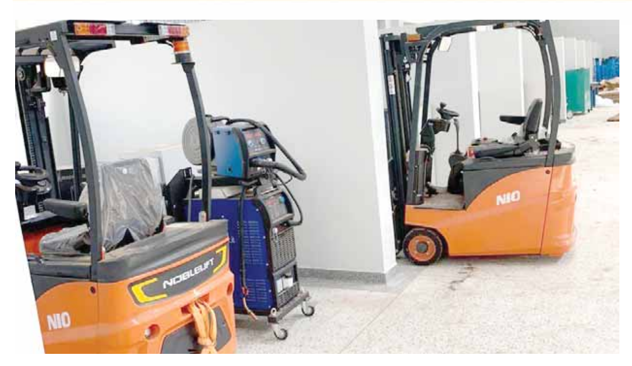
UTC Elgon has a well-equipped workshop where trainees can get hands-on training.