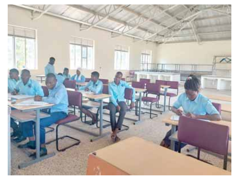
Kasodo Technical Institute has a well-equipped workshop where trainees get hands-on training.