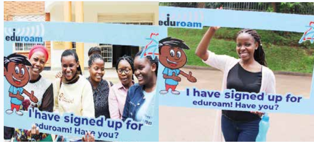
Students of Makerere University and Kyambogo University, full of excitement after signing up for eduroam, the Free, Secure and Trusted wireless network designed to benefit students, researchers and staff of member institutions, both on and off-campus.