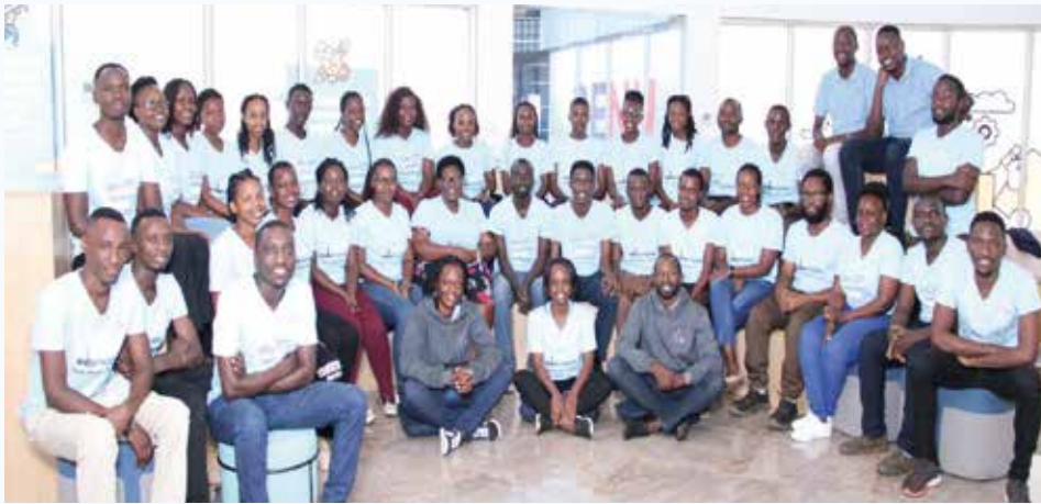
The RENU team of young, energetic and innovative staff that will sort you no matter what it takes!