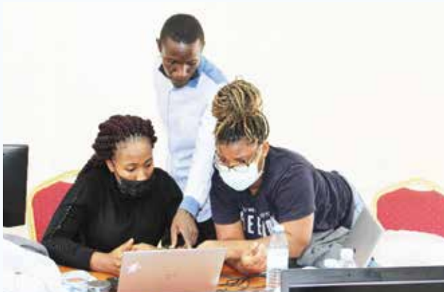
We give Direct Engineering Assistance (DEA) to our members to help their ICT staff improve and maintain their Local Area Networks.