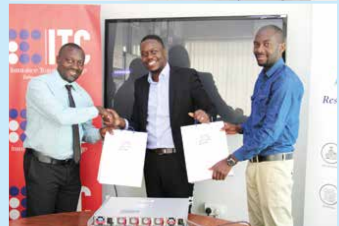
Our Direct Engineering Assistance component comes with network equipment support to strengthen member institutional Local Area Networks (LAN).