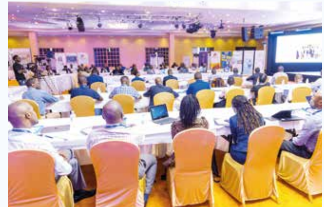
Understanding the needs of our members is our number one priority. Through dialogues with our member institutions, we are able to give them the solutions that work for them.