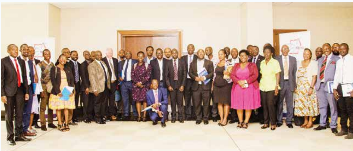
Representatives of some member institutions at RENU's 10 th Annual General Meeting at Nile Resort Hotel, Jinja. RENU now has a total membership of 230 institutions with 499 connected sites.