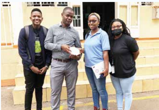
We support schools with Internet Access Points to enable them connect to eduroam, the Free, Secure and Trusted wireless network.