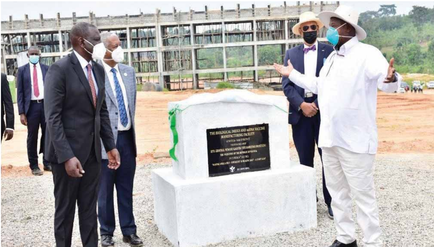
President Y.K. Museveni and his Kenyan counterpart William Ruto commissioned the project in 2021, and were optimistic this would propel Africa's capacity.

Vaccines doses. of mRNA vaccines to be produced at this facility guided by World Health Organization standards.